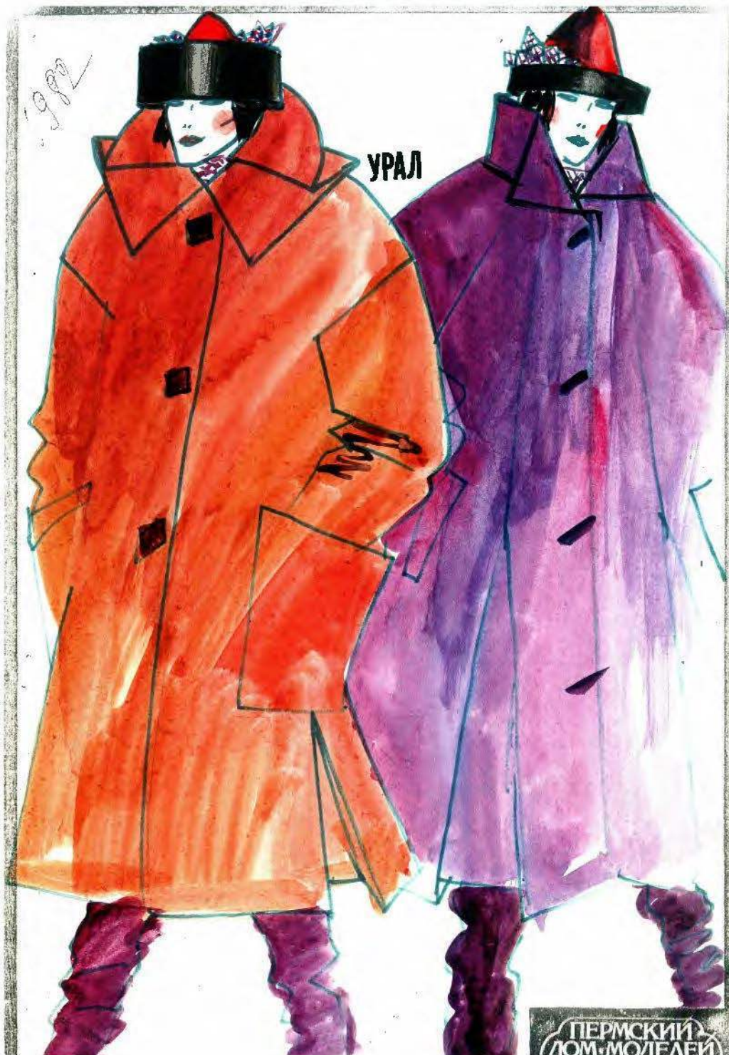
Figure 2 – The sketch “Ural,” the first form for Leipzig Trade Fair 1982 by Leonid Lemekhov