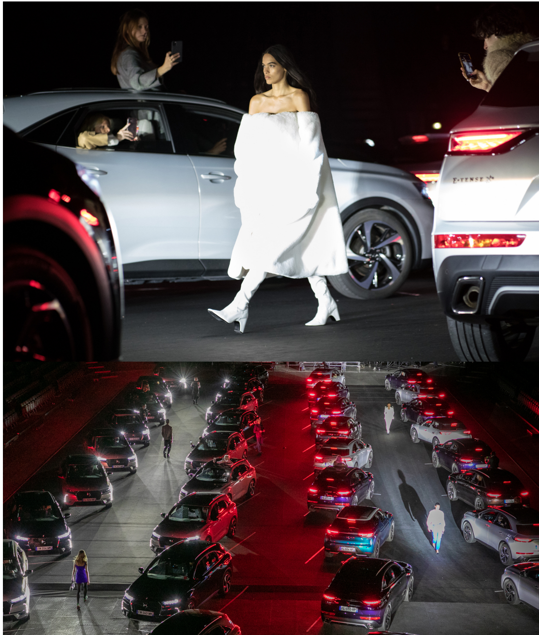
Figure 6: Models walk the runway during the Coperni show as part of the Paris Fashion Week Womenswear Fall/Winter 2021/2022 on March 04, 2021 in Paris, France. In a time of social distancing and to allow the live presence of guests, the set of the fashion show takes its form thanks to a drive-in in which the cars that host (safely) the guests become at the same time a safe place and an intrinsic element of the scenography.