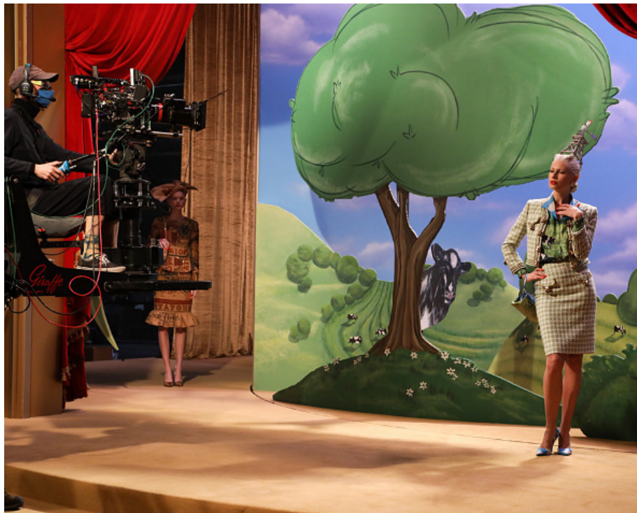
Figure 7: A model poses in the backstage at the Moschino Fashion Show during the Milan Fashion Week Fall/Winter 2021/2022 on February 25, 2021 in Milan, Italy. The show took the form of a fashion film that, recalling Cukor's Women , re-enacted the glamour of the haute couture ateliers of the 1950s.

New York (Park Avenue Armory), Paris (Garde Républicaine) and Shanghai (Maison Hermès). A live triptych composed of two ballets and a fashion show, which begins at 8.31 am in New York (2.31 pm in Paris and 9.31 pm in Shanghai) with a prologue choreographed by Madeline Hollander. After seven minutes of performance, the direction moves to Paris, where the actual fashion show comes to life. It continues after eight minutes in Shanghai, concluding the event with a choreography by Gu Jiani.