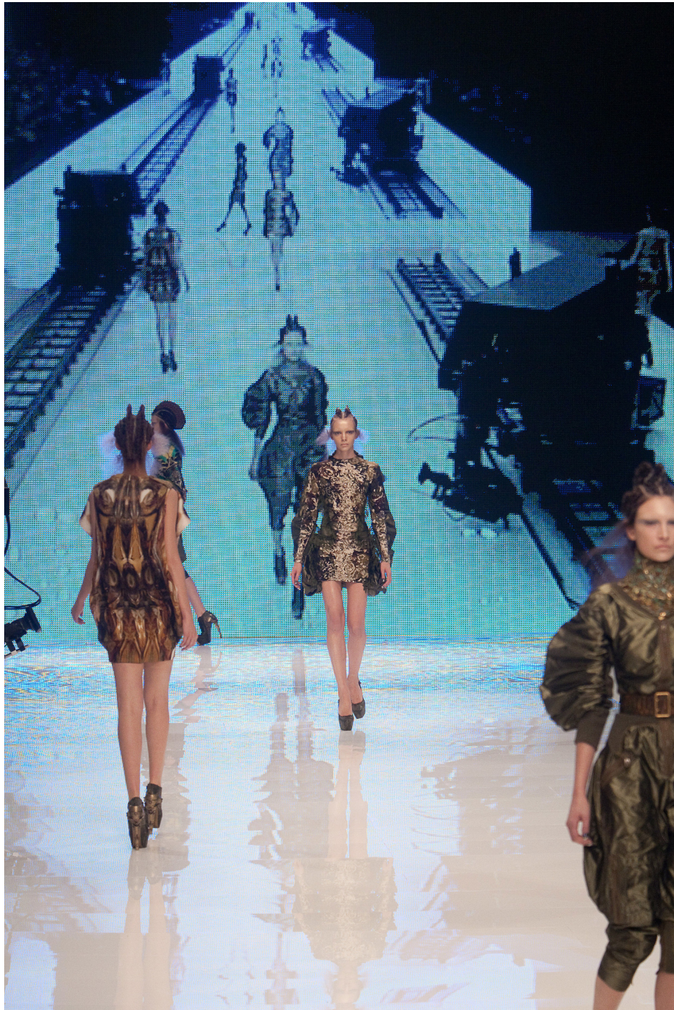
Figure 1: Models walk the runway during Alexander McQueen Pret-a-Porter show as part of the Paris Womenswear Fashion Week Spring/Summer 2010 at Palais Omnisports de Bercy on October 6, 2009 in Paris, France. The show was created in collaboration with Nick Knight and broadcast live on the SHOWstudio website.