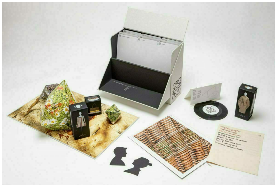
Figure 8: The first Show-in-a-Box designed by J.W. Anderson for Loewe. A box containing a multiform quantity of objects: fabric samples, the paper pattern (which can also be downloaded, if necessary, online) of one of the main pieces to be able to recreate the garment at home, as well as images of the collection's looks. A box that also becomes the location for a fashion show with a set to assemble and a cardboard record player to play the event's soundtrack.