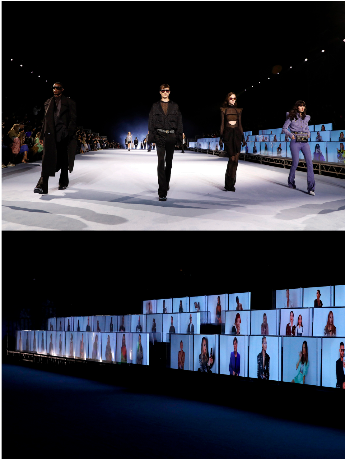
Figure 5: The Balmain fashion show during Paris Women's Fashion Week Spring/Summer 2021 on September 30, 2020 in Paris, France. The guests were present in a hybrid form, some in person, others connected online, but attending the fashion show thanks to the digital seating set up scenographically as rows of monitors. The meaning of the front row is thus preserved even in times of social distancing.