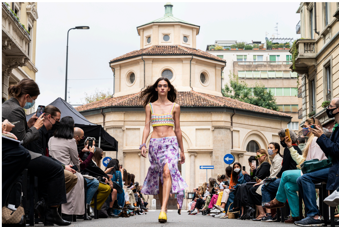
Figure 4: A model walks the runway at the Marco Rambaldi fashion show during the Milan Women's Fashion Week on September 25, 2020 in Milan. In order to allow for the live presence of the public, it has become normal practice to set up fashion shows in urban spaces that allow not only greater distance but also greater sharing of the event between insiders and outsiders.