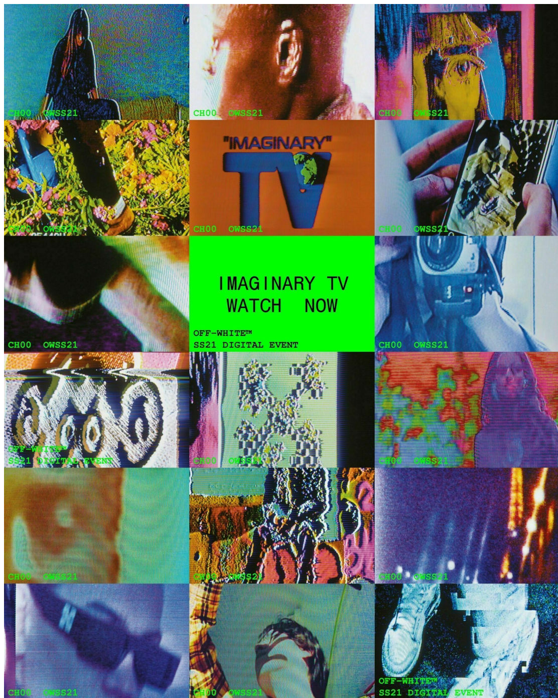
Figure 9: The Imaginary TV. The platform created by Virgil Abloh that offers different editorial contents and also includes Off-White's collections. A digital channel to produce and promote contents capable of better defining and narrating the brand's identity.