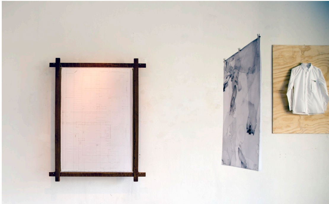
Figure 4: Exhibition photograph by Giulia Ripalti