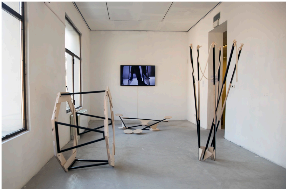
Figure 3: Exhibition photograph by Giulia Ripalti