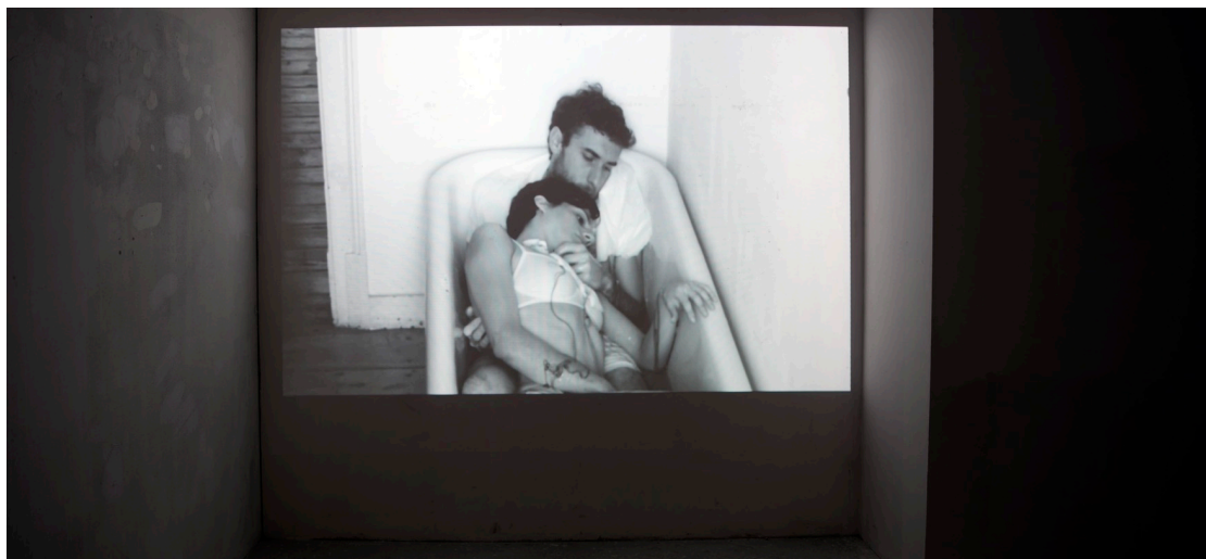
Figure 9: Exhibition photograph by Giulia Ripalti