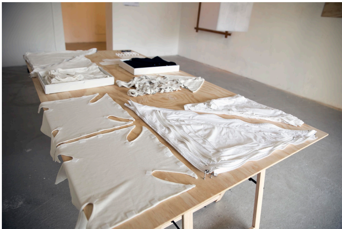
Figure 5: Exhibition photograph by Giulia Ripalti