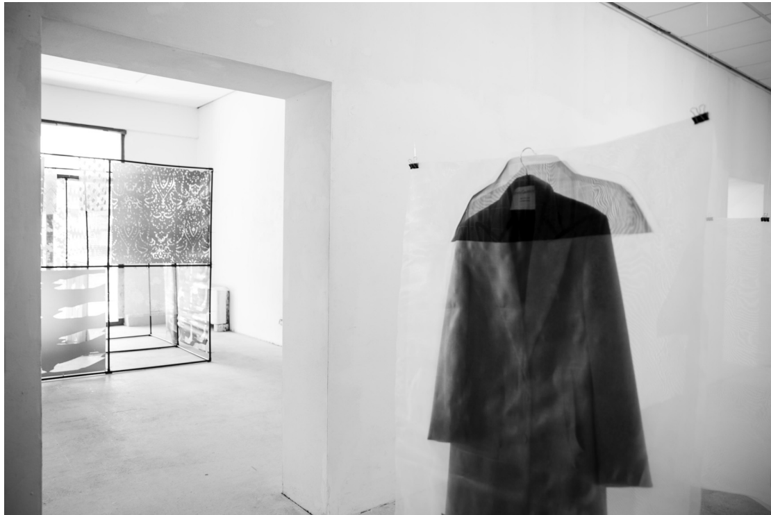
Figure 8: Exhibition photograph by Giulia Ripalti