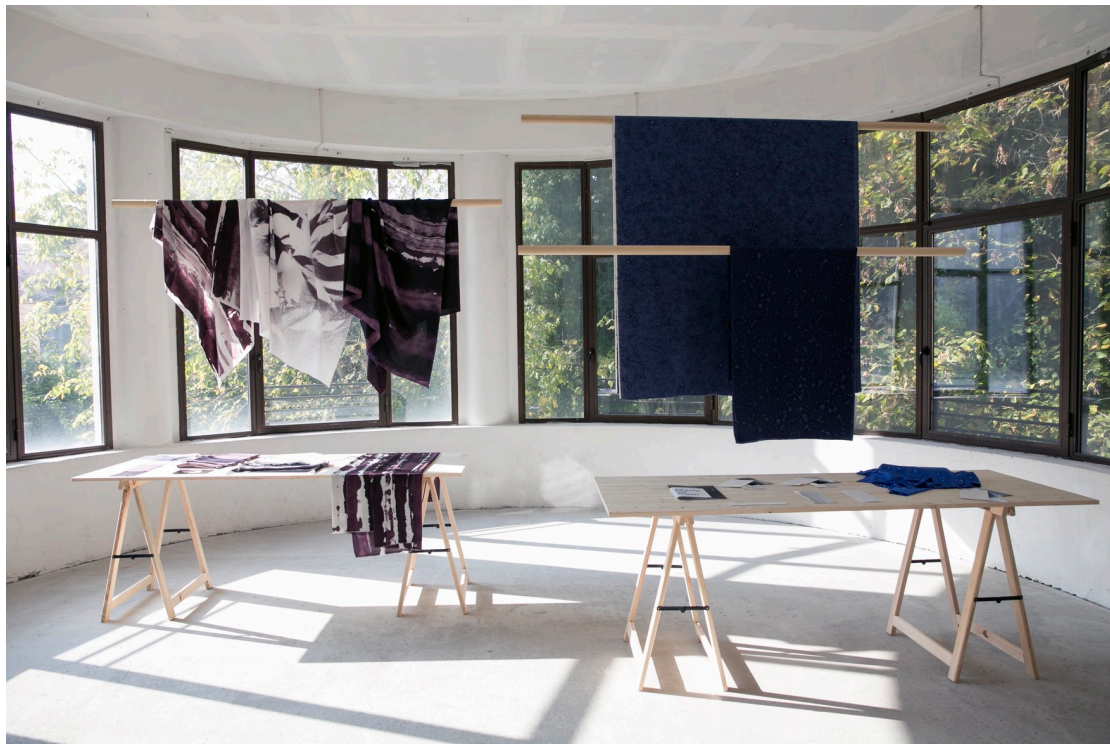
Figure 2: Exhibition