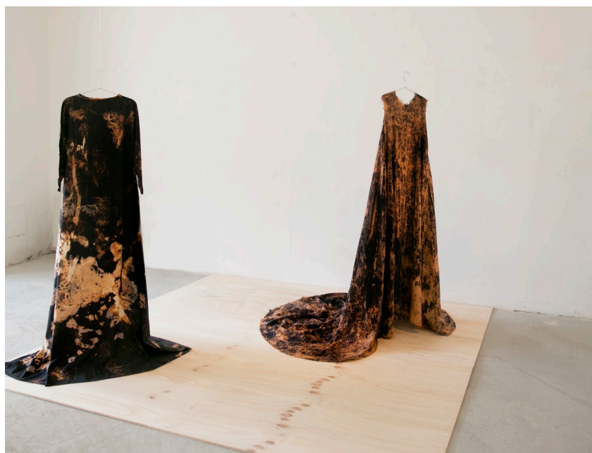
Figure 7: Exhibition photograph by Giulia Ripalti