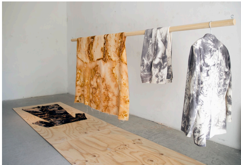
Figure 6: Exhibition photograph by Giulia Ripalti